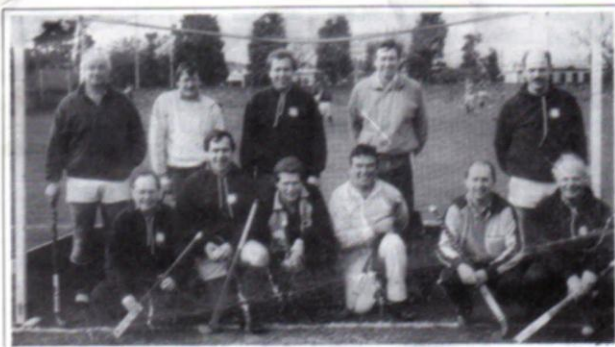
OLD CRANLEIGHANS VETERANS